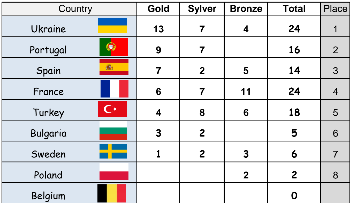
Table of medals of athletics